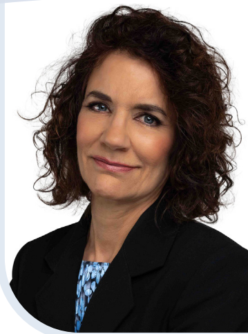
Author: Cheryl Ebinger

usually find much cheaper rates by foregoing the carrier's offer and instead getting your shipping insurance with a third-party company. The difference can be as much as $0.50 per $100 of insurance, and while this doesn't seem like a huge amount, these fees can really add up – especially if you're shipping high value items like watches, jewellery or electronics.